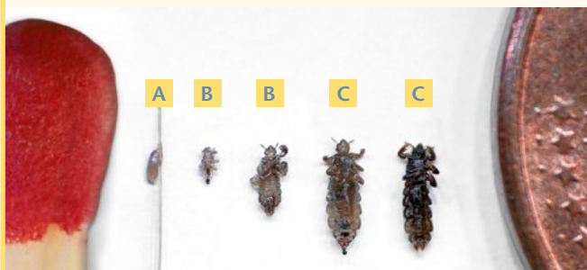
Size comparison: match/one-penny coin

... occurs through several different stages, from the egg to the nymph stage, and then on to the adult, sexually mature louse. The eggs ( A ) are deposited by the adult female louse and attached to the hair shaft near the scalp with a glue-like substance that is not water-soluble. Eight to ten days after the eggs are laid, nymphs hatch out of the eggs ( B ). These develop over the following 9 to 11 days into adult, sexually mature lice ( C ) – and the life cycle begins once again.